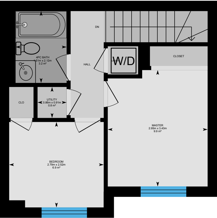
2nd Floor Exterior Area 39.0 m 2