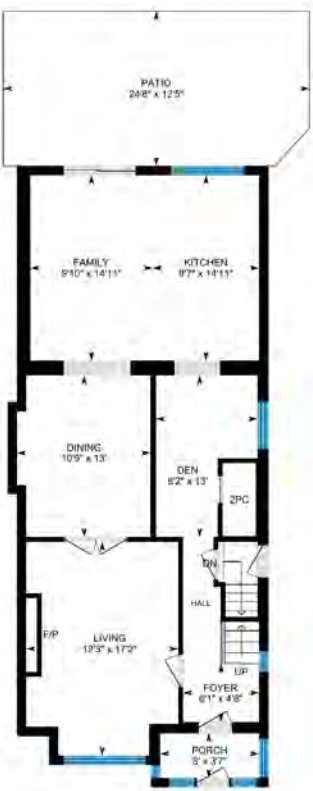
Main Floor Exterior Area 943.07 sq ft

Main Building: Total Exterior Area Above Grade 1574.32 sq ft