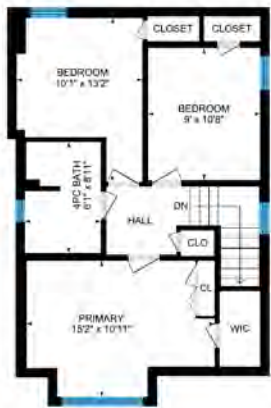
2nd Floor Exterior Area 631.25 sq ft