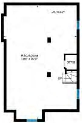
Basement (Below Grade) Exterior Area 616.46 sq ft