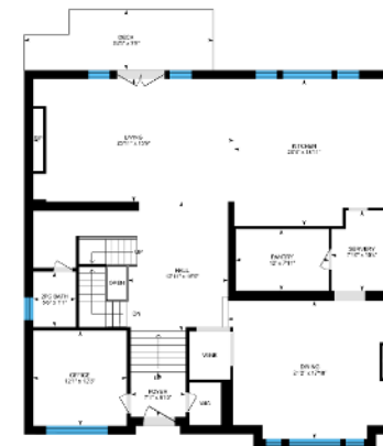
Main Floor Exterior Area 2294.85 sq ft

Main Building: Total Exterior Area Above Grade 6320.53 sq ft