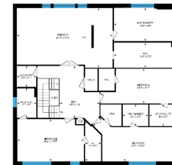
2nd Floor Exterior Area 2262.89 sq ft